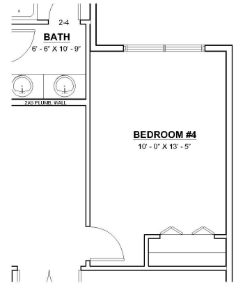
4th Bedroom Upgrade Option